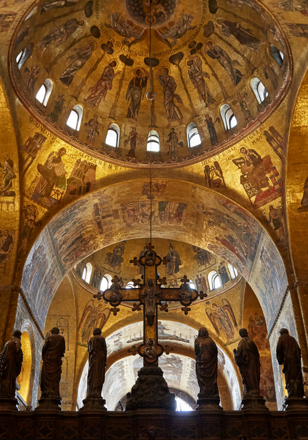
The sanctuary of the Basilica di San Marco, Venice, where Monteverdi served from 1613 until his death in 1643.