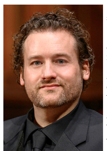
A note from the Artistic Director

I began Te Deum in 2008 to share and breathe life into sacred music. This has typically meant we performed music of the Western Judeo-Chrstian persuasion. However, I have always been interested in bringing an expansive understanding of the word Sacred. One early 20th-century theologian defines sacred as that which is of ultimate importance. I understand that in life, love, and our interactions with our world and humankind. In our concert presentations, the more specifically sacred the music, the more I offer universal context, and the more specifically secular, the more I aim to give my audience a divine lens through which to understand the music.