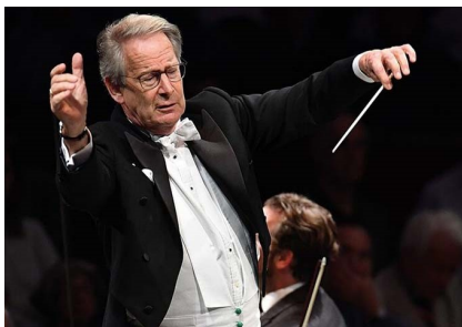
John Eliot Gardiner