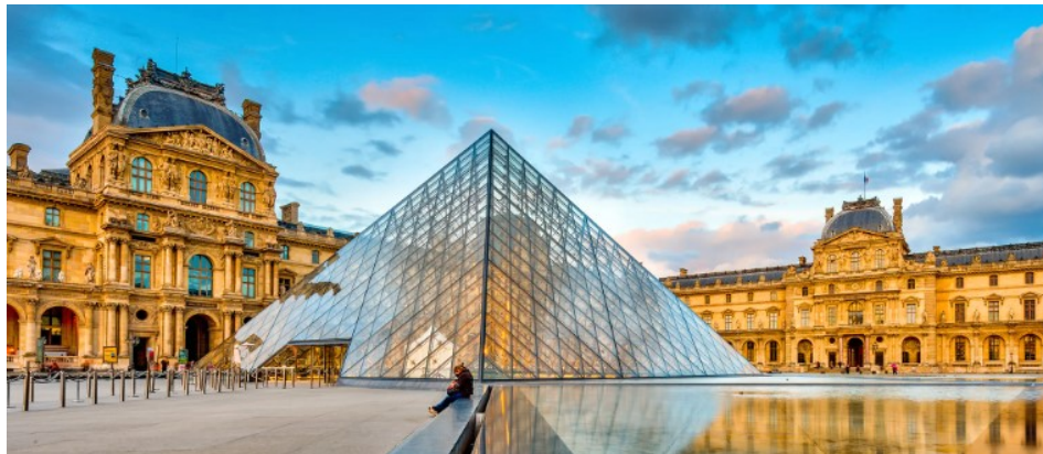
The Louvre Museum in Paris

XIV's original vision for the Palace of Versailles included his own private 700-seat theater as part of the north wing of the Palace. It wasn't completed during his lifetime, but it was finished during the rule of his successor, King Louis XV. The theater opened in 1770. It was actually in operation for only about 30 years before being closed as a result of the French Revolution. It sat dormant for more than 200 years. In 2007 it was fully renovated and reopened, and is now the venue for a few dozen exclusive orchestra concerts and recitals each year. Tickets are difficult to obtain, so you will be among a privileged few to see this spectacular theater and experience timeless music there.