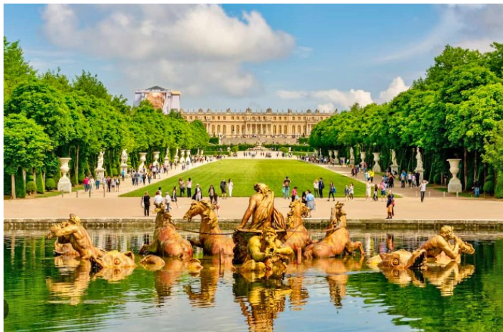
Palace of Versailles

Tuesday, June 10 - After a healthy breakfast at the hotel (breakfast is included each morning), you will join us for a guided tour of the spectacular Palace of Versailles, built by King Louis XIV of France (the "Sun King," France's